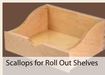
Scallops for Roll Out Shelves