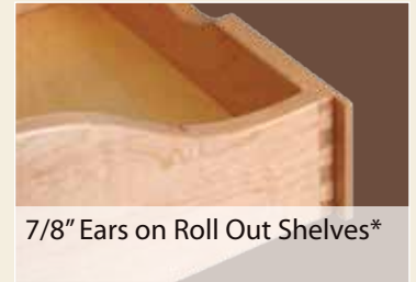
7/8" Ears on Roll Out Shelves*