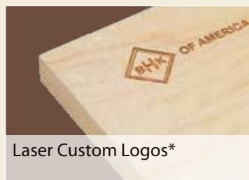
Laser Custom Logos*