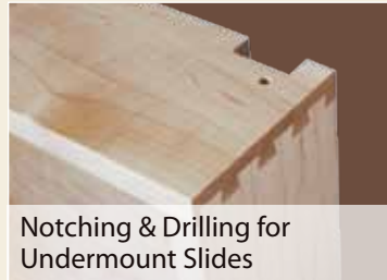
Notching & Drilling for Undermount Slides