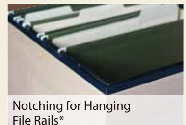
Notching for Hanging File Rails*