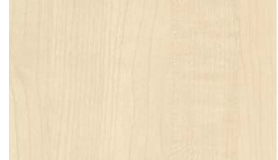
White Maple (PP)